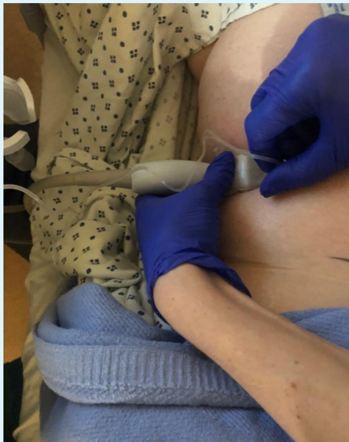
Figure 1: Lorem ipsum dolor sit amet, consectetur adipiscing elit, sed do eiusmod tempor incididunt ut labore et dolore magna aliqua.